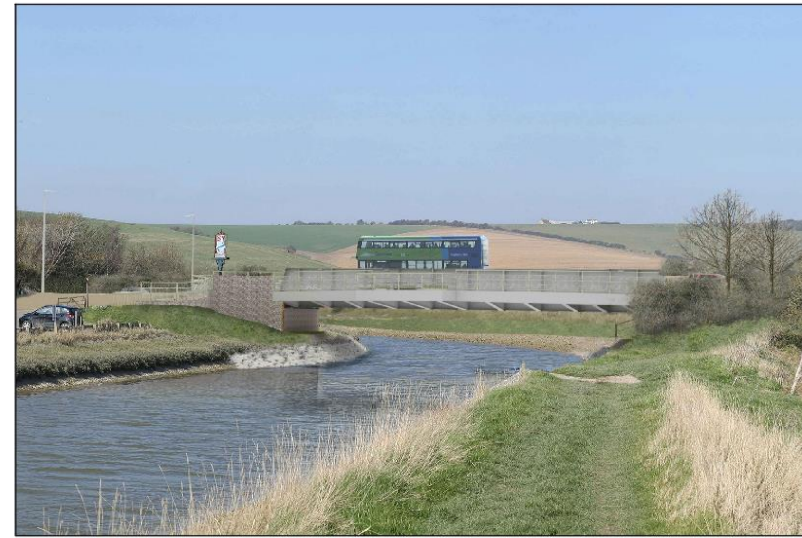
SOUTH ELEVATION NTS

The Common Seal of THE EAST SUSSEX COUNTY COUNCIL was hereunto affixed in the presence of: Attesting Officer on the _____ day of _____ 2023