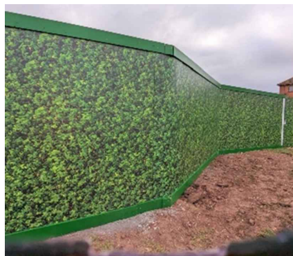
Illustration of site hoarding